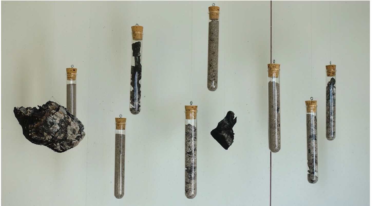
Ashes to ashes Studio installation Charred wood and ashes