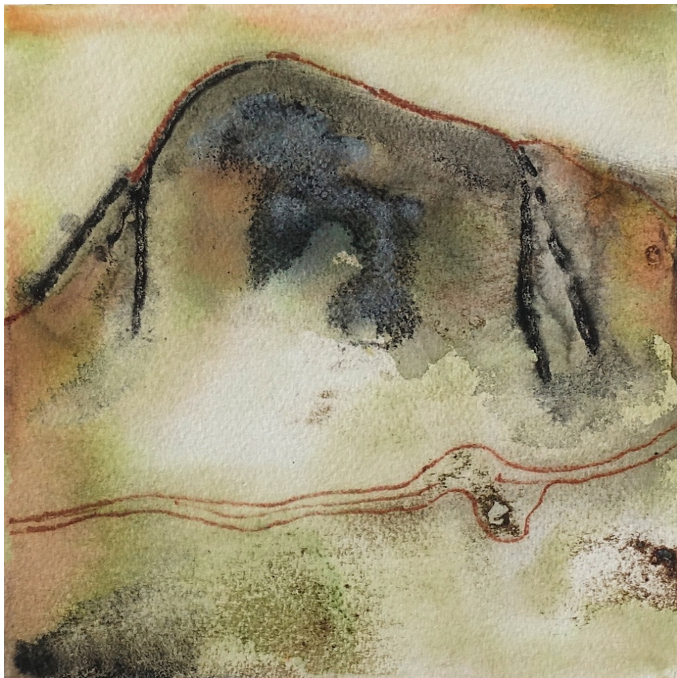
Lost Landscape 2 Watercolor, pencil and ashes 6" x 6" (15cm x 15cm)