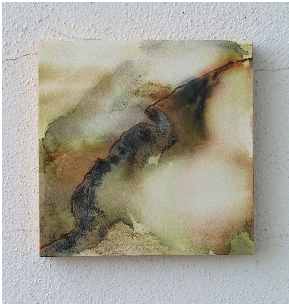
Lost Landscape 6 Installation view Watercolor and ashes on cradled birch panel 6" x 6" (15cm x 15cm)