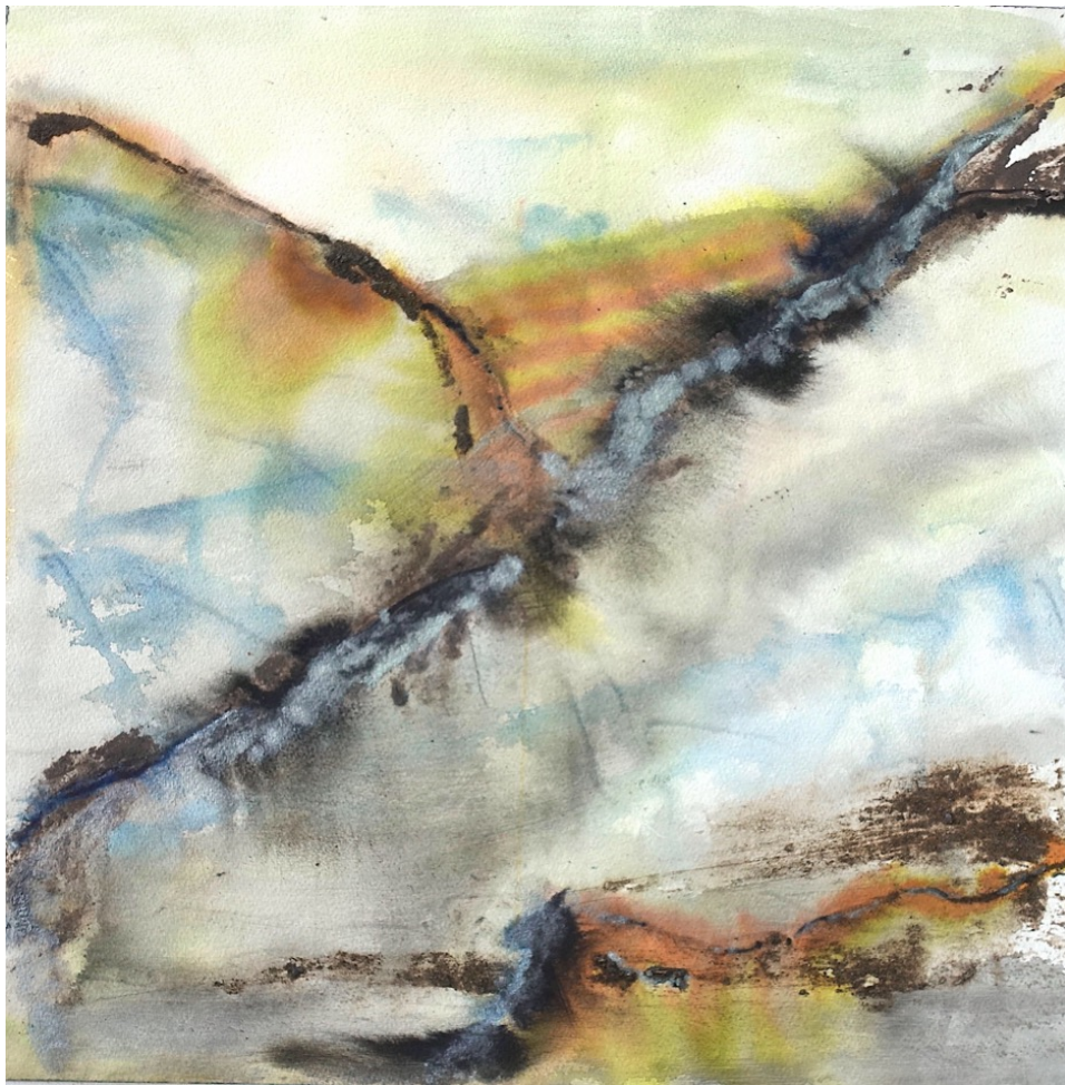
Lost Landscape 1 Watercolor and ashes 18" x 18" (46cm x 46cm)