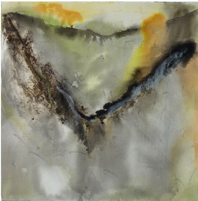
Lost Landscape 5 Watercolor and ashes 18" x 18" (46cm x 46cm)

Lost landscapes is a series of paintings using watercolor paints and ashes to explore the landscapes that are destroyed by fires all over the world. Incorporating ashes into the painting is intended as a direct method of expressing the landscapes that are lost through fire.