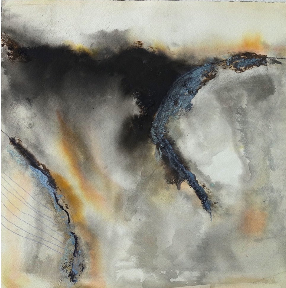
Lost Landscape 3 Watercolor and ashes 18" x 18" (46cm x 46cm)